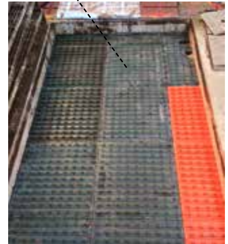
Stab Mat installed on the set back area