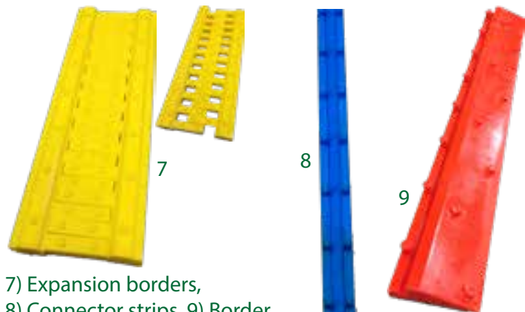
7) Expansion borders, 8) Connector strips, 9) Border without berms.